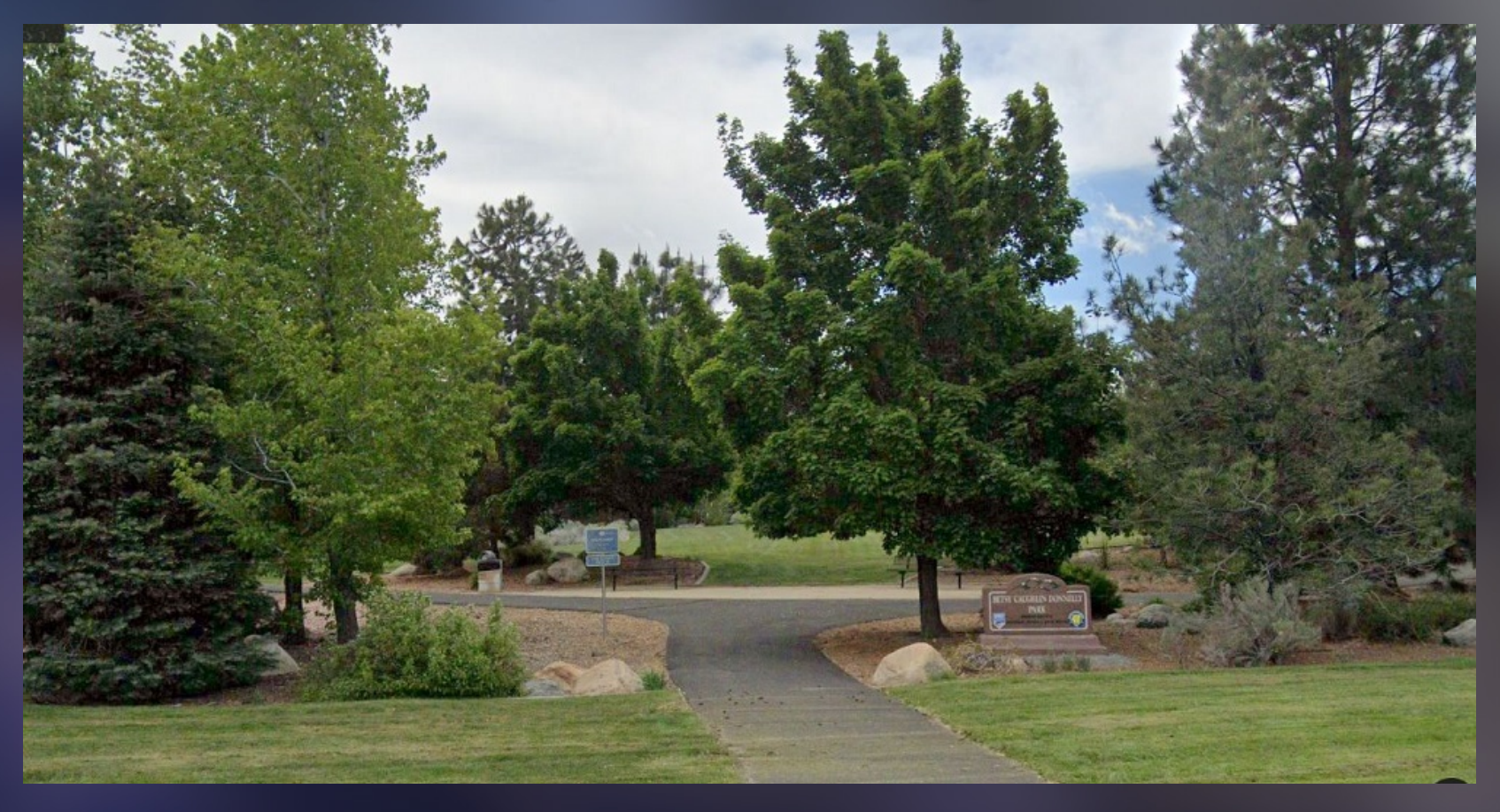
June 2, 2020